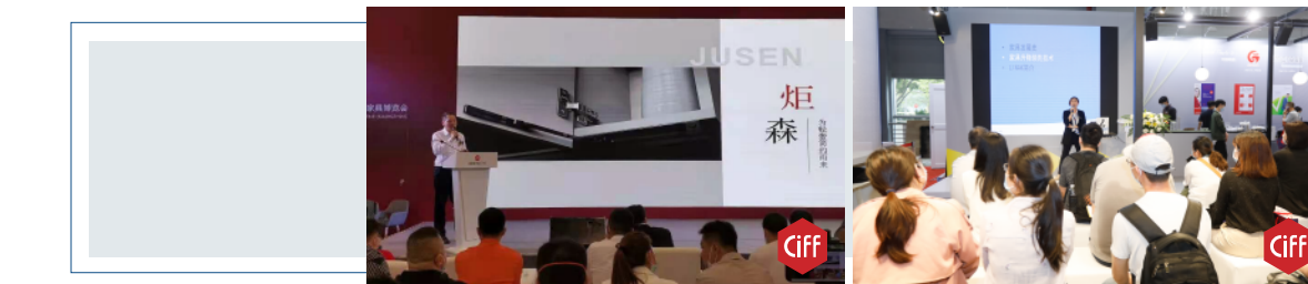
Coming for Mild Luxury & Minimalism--- Create the Future Together by Customization