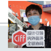
Furniture Dealer from Harbin

The Pearl River Delta is an important distributing center for furniture production and sales. ClifF (Guangzhou) is a mega industry exhibition with a large scale and a large number of exhibitors. It is also an important platform for product launch. We attend ClifF (Guangzhou) 2021 to know more about what's new and the future trends. We have also bought our favorite products.