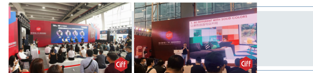
Customized Furniture Benchmark 2021