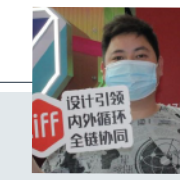
Dealer from Guangzhou

ClifF (Guangzhou) is very influential in the industry so some of my clients entrusted me to help them purchase in ClifF. I've found the products I am interested in here, and also provided my contact information. I will communicate further with the chosen exhibitors after the exhibition.