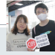
Home Decoration Designer from Yulin, Shaanxi

I am engaged in home decoration design. This time I attend ClifF (Guangzhou) to seek for cooperations with furniture and materials enterprises. The venue is so large that I haven't finished visiting any of the halls. I want to see more before making cooperation decision.