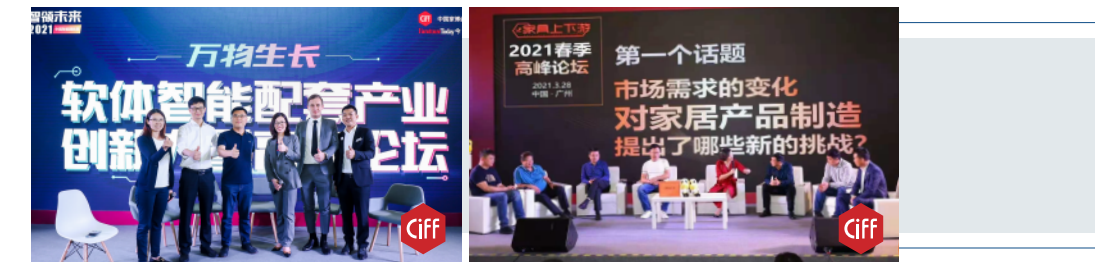
Upholstery Intelligent Supporting Industry Innovation Summit

CIFM/interzum guangzhou 2021 was not only a trade fair that gathered leading brands with unlimited opportunities but also an ideological feast to get into cutting-edge technologies and trends. A rich variety of exciting professional forums and activities were held at the exhibition site. They focused on hot topics in the industry and in-depth discussions on the infinite possibilities brought by new materials and technologies, allowing visitors to deeply feel the charm of material innovation and technology research.